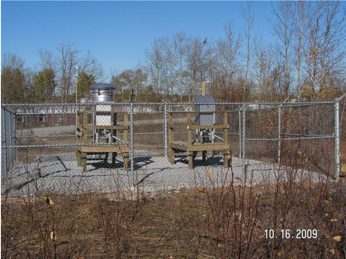
Figure 3: Photo of Air Sampling Station at the Extendicare Facility Site