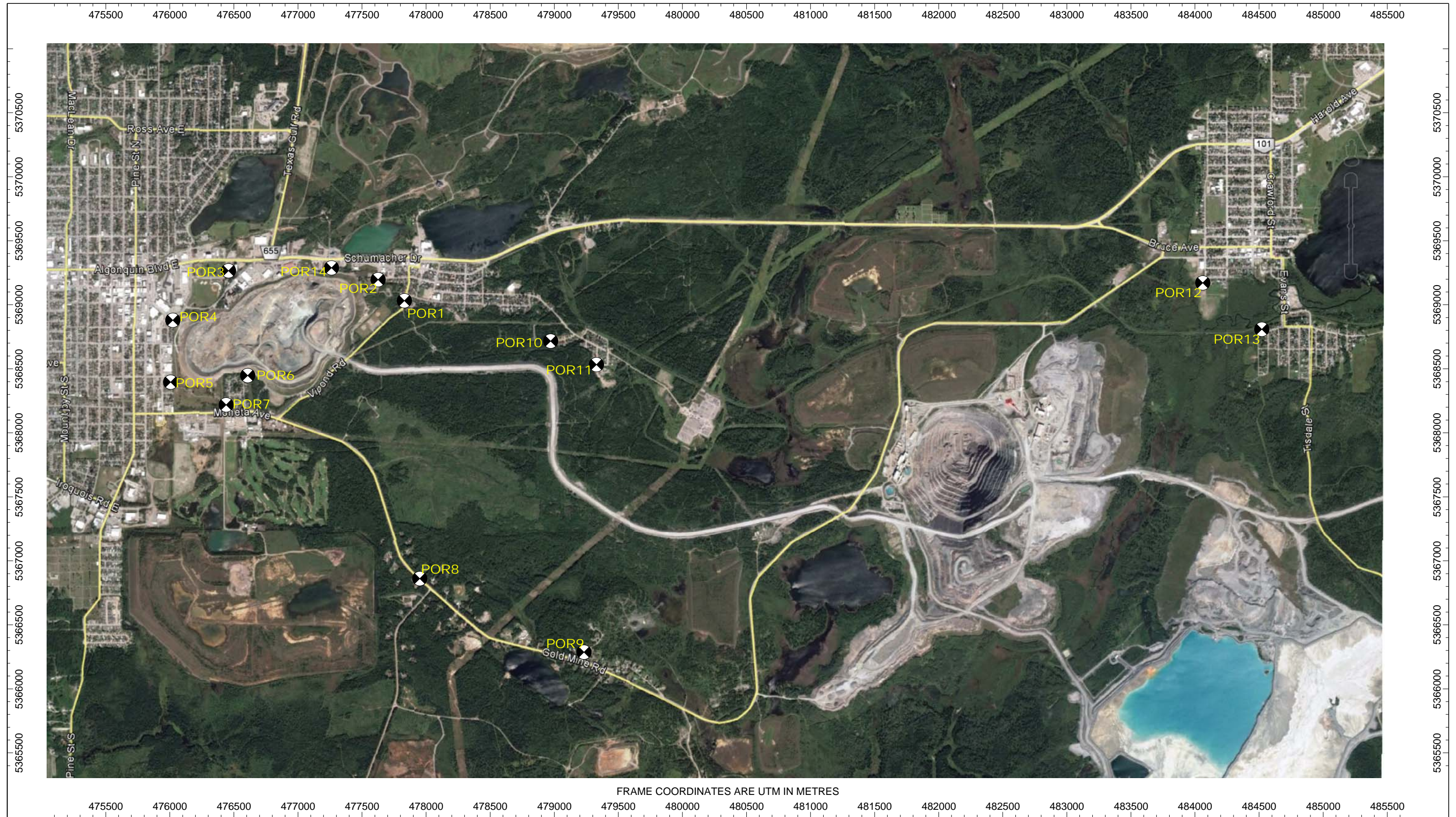
Figure 1: Aerial Image Showing Hollinger Pit and Measurement Positions / Neighbouring Points of Reception