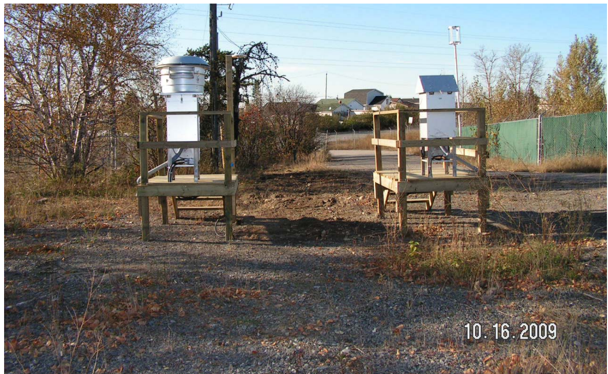
Figure 2: Photo of Air Sampling Station at the Shania Twain Road Site