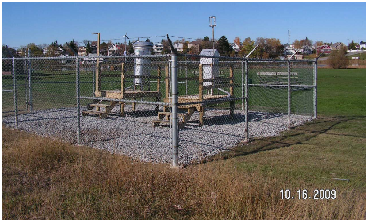
Figure 1: Photo of Air Sampling Station at the MRCA Office Site