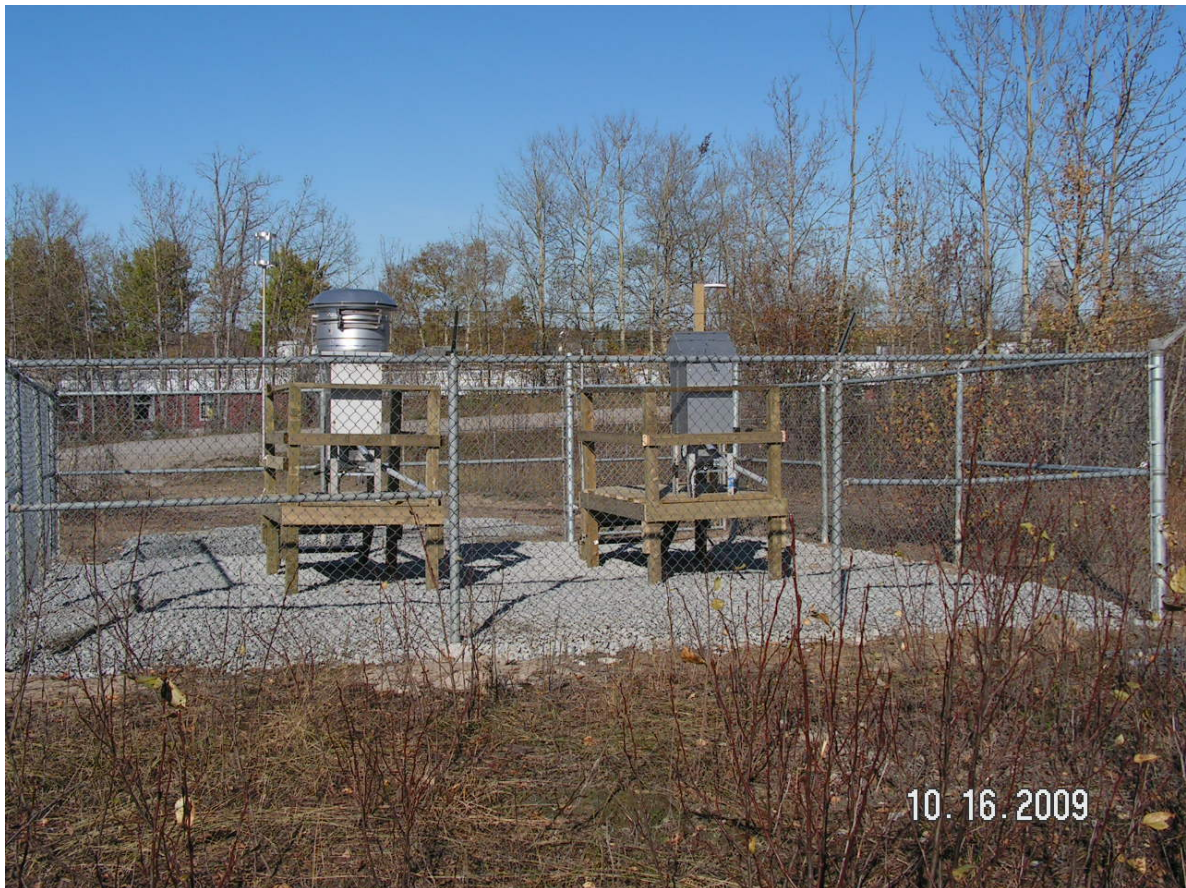
Figure 3: Photo of Air Sampling Station at the Extendicare Facility Site